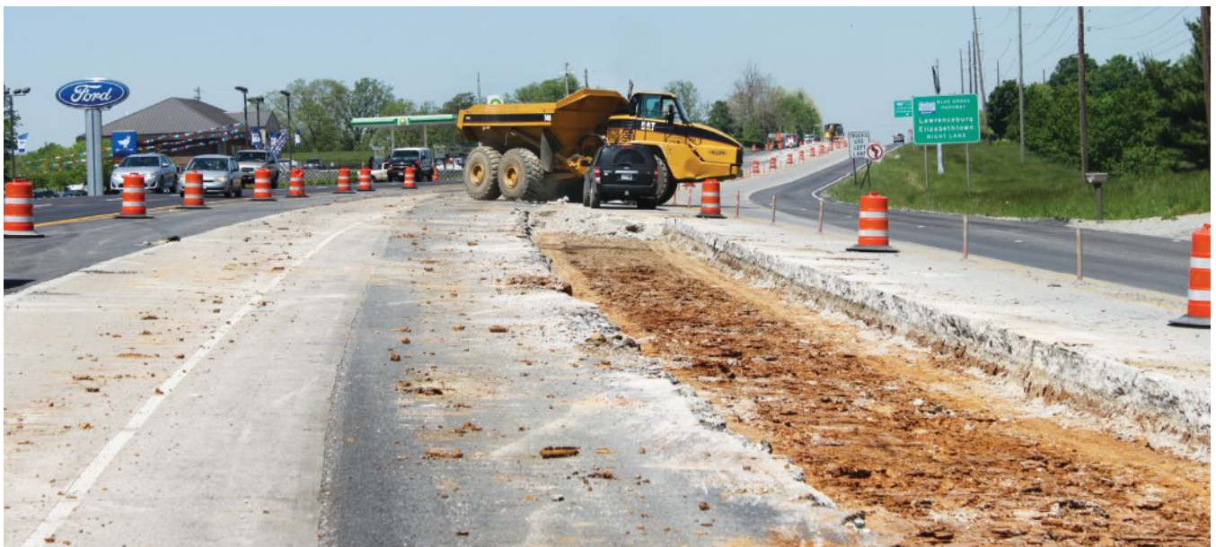
Keeneland allowed its main entrance at Highway 60 and Man o' War Boulevard to be completely closed in June.

Keeneland allowed its main entrance at Highway 60 and Man o' War Boulevard to be completely closed in June. "We were able to tear into the concrete, pave the necessary lifts and opened the road up to traffic in two days," mentioned Billings. The extended cure time of concrete and additional time to make width changes significantly extends this process from days to weeks.