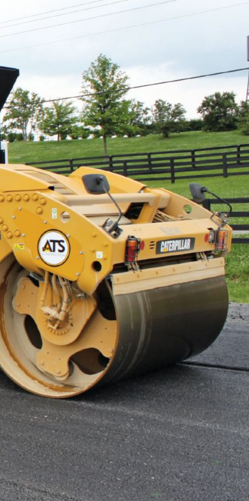
In all, 232,000 tons of asphalt base and surface mixes were paved and compacted along the 6.2-mile stretch of Kentucky's Highway 60.