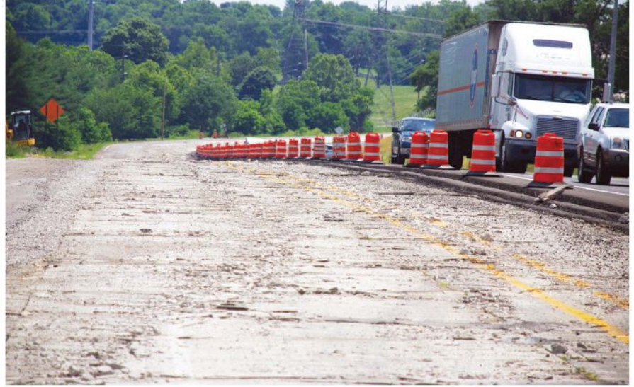
Antigo Construction Inc. fractured the 10-in.-thick concrete pavement prior to receiving the overlay to minimize the occurrence of reflective cracking.

The Transportation Cabinet uses a 40-year period for comparing pavement life, similar to that of the concrete road that was at the end of its life and in poor condition. At 15- to 18-year intervals, the asphalt surface course will be milled and replaced with an overlay as a quick maintenance item. "While we project 40 years, there is no reason why the road could not be a perpetual pavement (where the main pavement structure remains intact beyond the 40 years) with proper