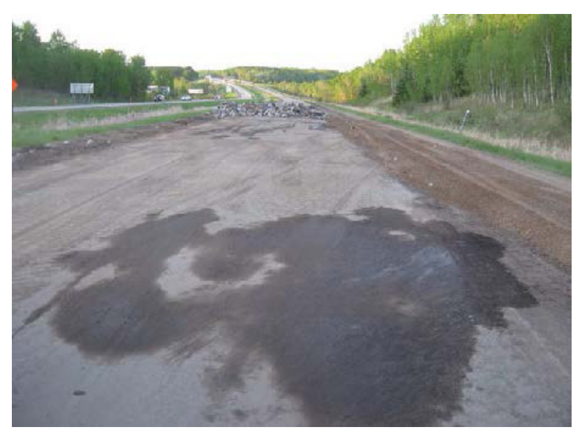
Underlying concrete layer not damaged after breaking and removing upper layers of concrete and asphalt