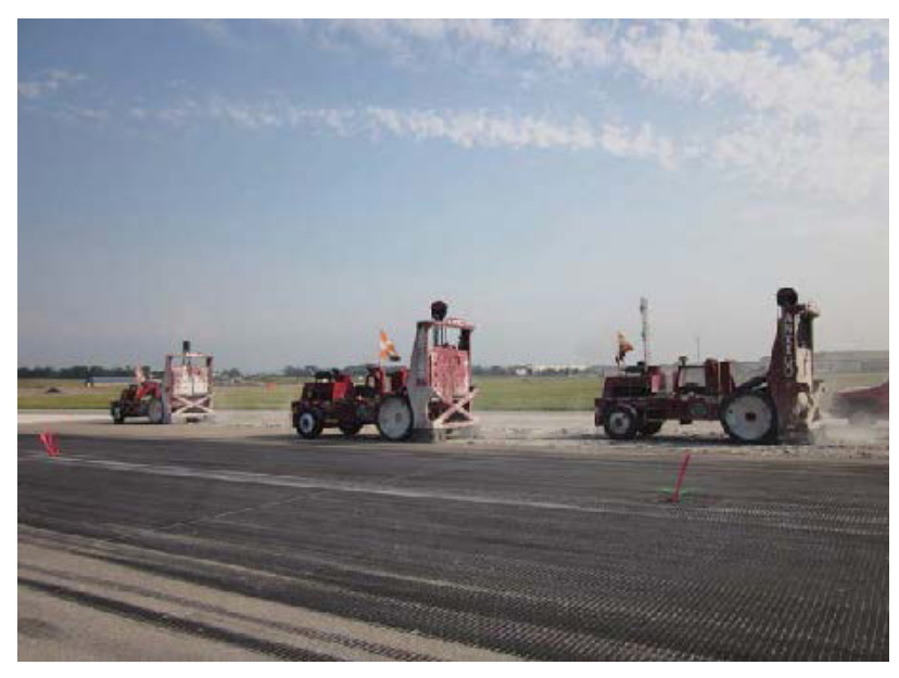
8600 Badger Breakers® breaking upper layer of concrete