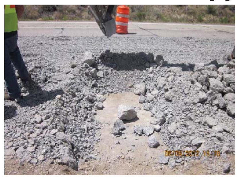
Underlying lean concrete base not damaged after rubblizing concrete