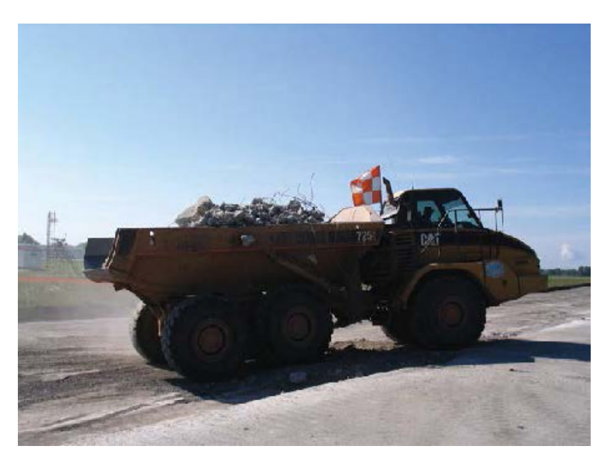
Hauling broken concrete