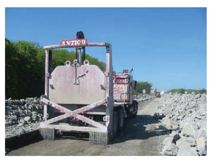
Breaking lower layers