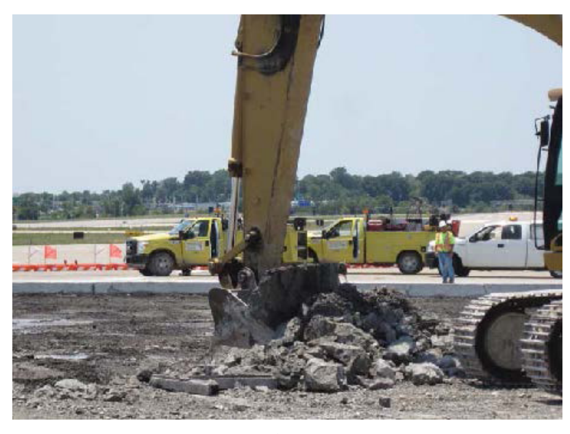
Removing upper layer of concrete and asphalt layer