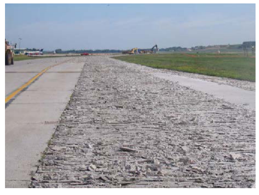
Surface of broken concrete