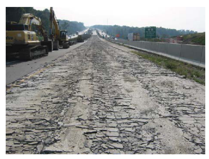
Upper layer of concrete broken with T8600 Badger Breaker®