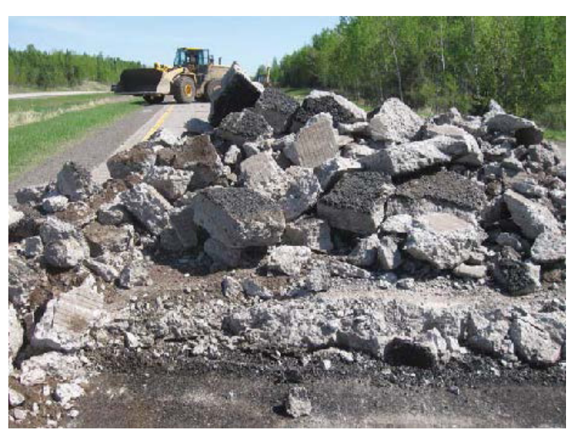
Removing upper layer of concrete