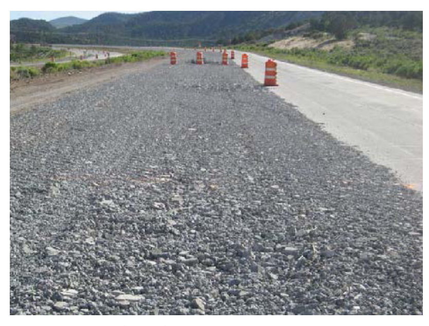
Surface of rubblized concrete layer