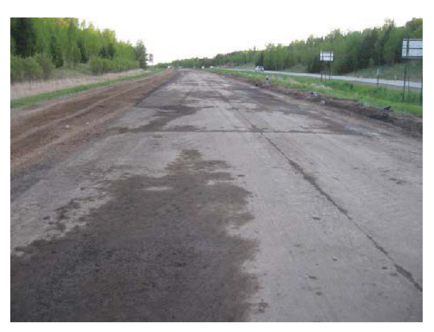
Underlying concrete layer not damaged after breaking and removing upper layers of concrete and asphalt