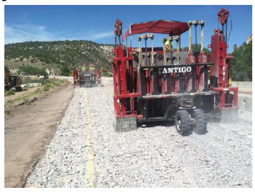
MHB Badger Breaker® rubblizing concrete