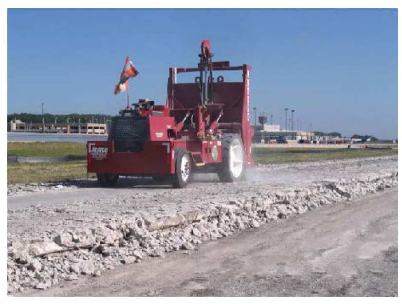
8600 Badger Breaker® breaking concrete