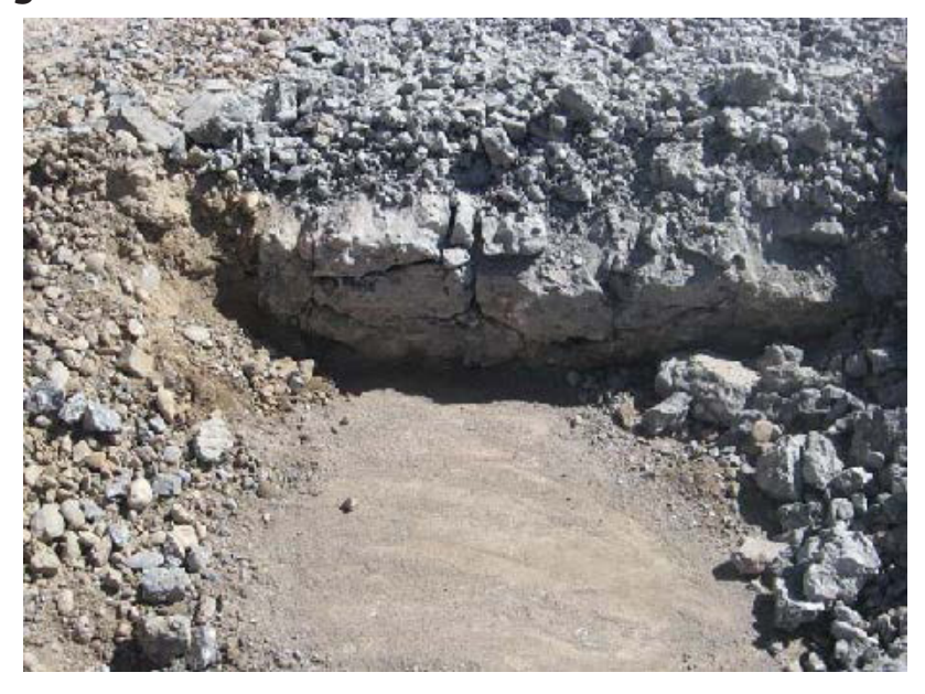
Underlying lean concrete base not damaged after rubblizing concrete