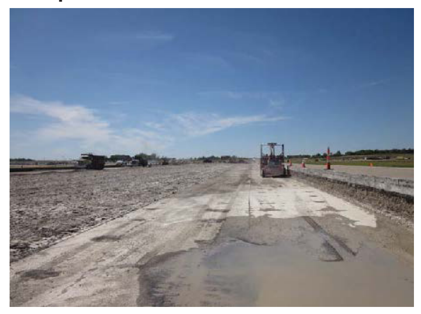
Breaking lower layer of concrete