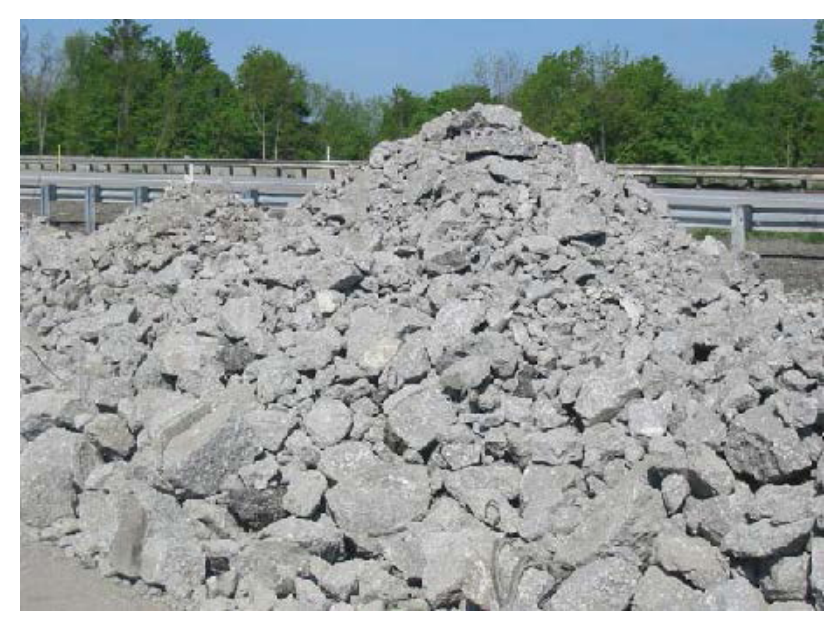
Concrete removed and windrowed