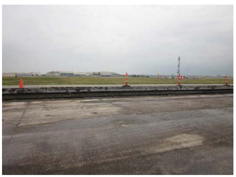
Underlying concrete layer not damaged after breaking and removing upper layers of concrete and asphalt