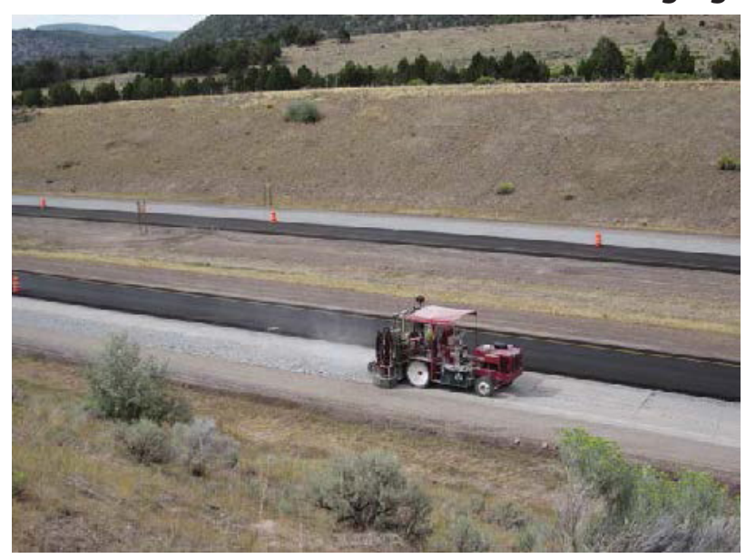
MHB Badger Breaker® rubblizing concrete