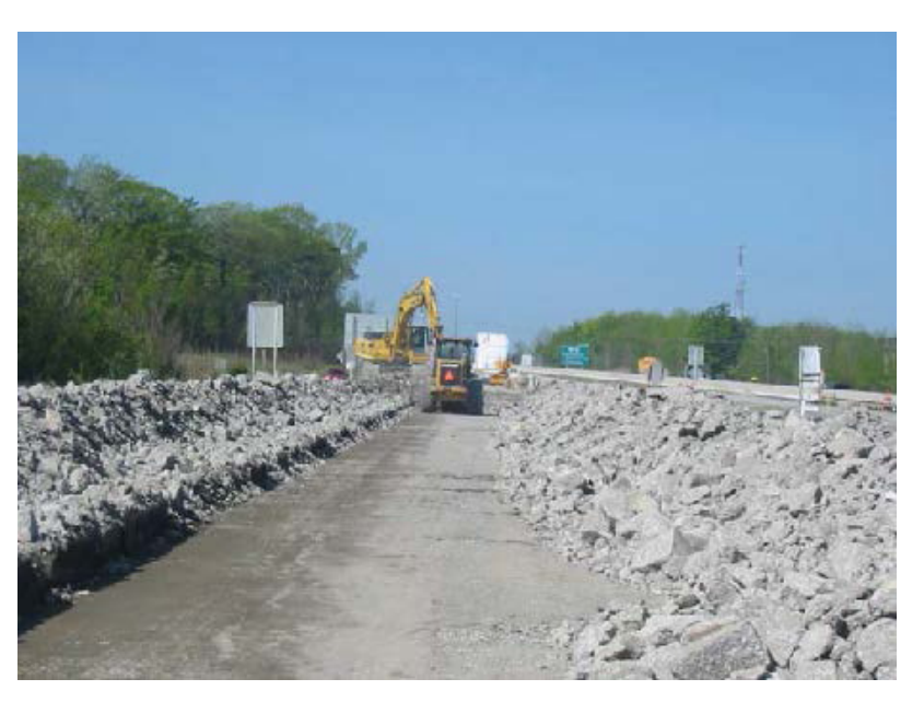
Removing upper layer of concrete