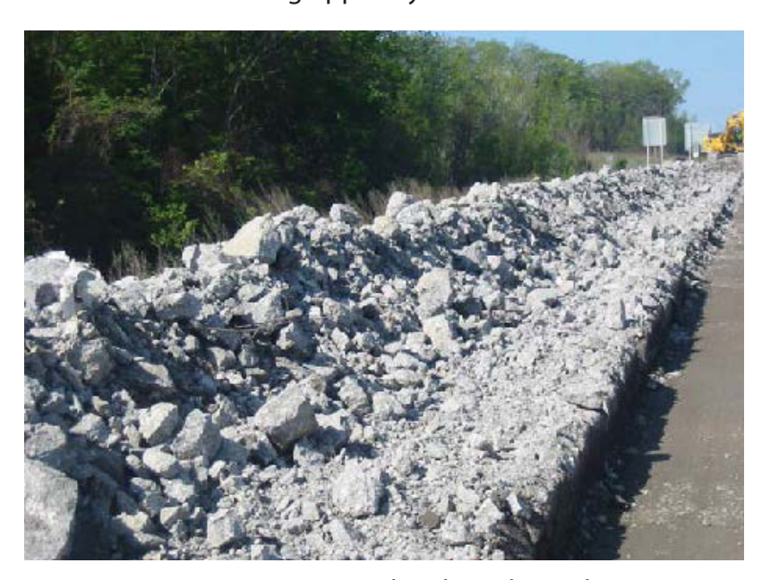
Concrete removed and windrowed