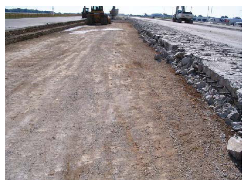
Underlying CTB layer not damaged (required 2nd pass to break CTB layer for removal)