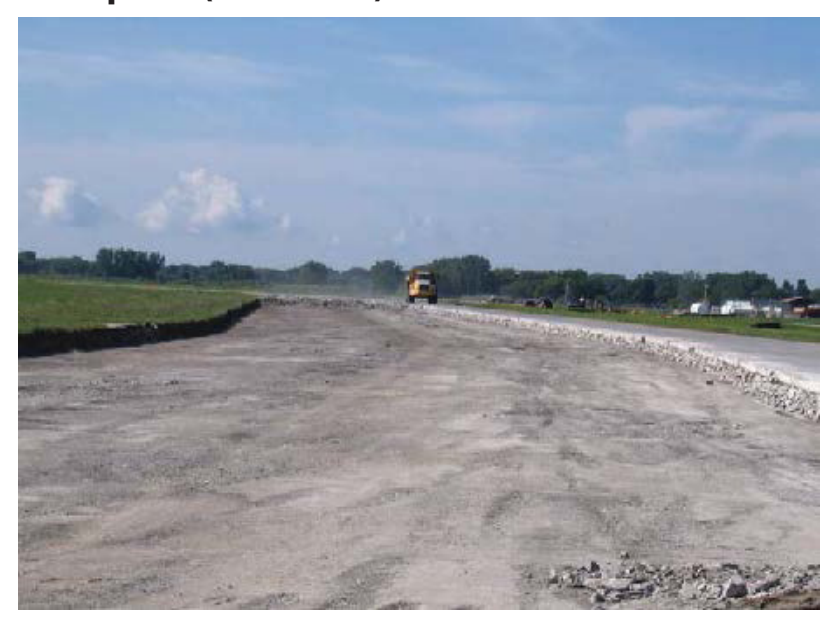
Underlying asphalt layer on right not damaged after breaking and removing upper layer