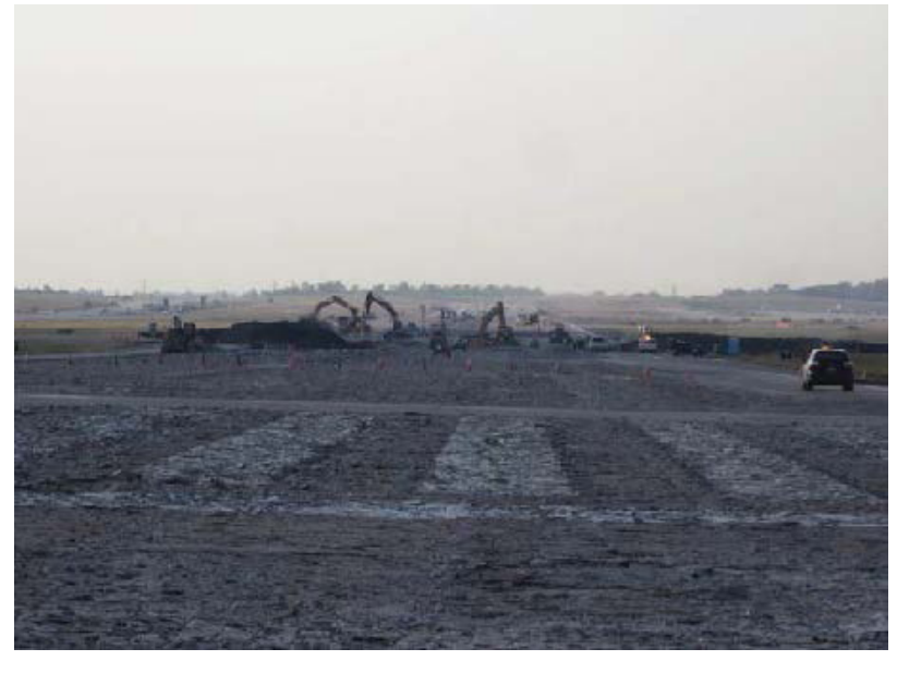
Upper layer of broken concrete