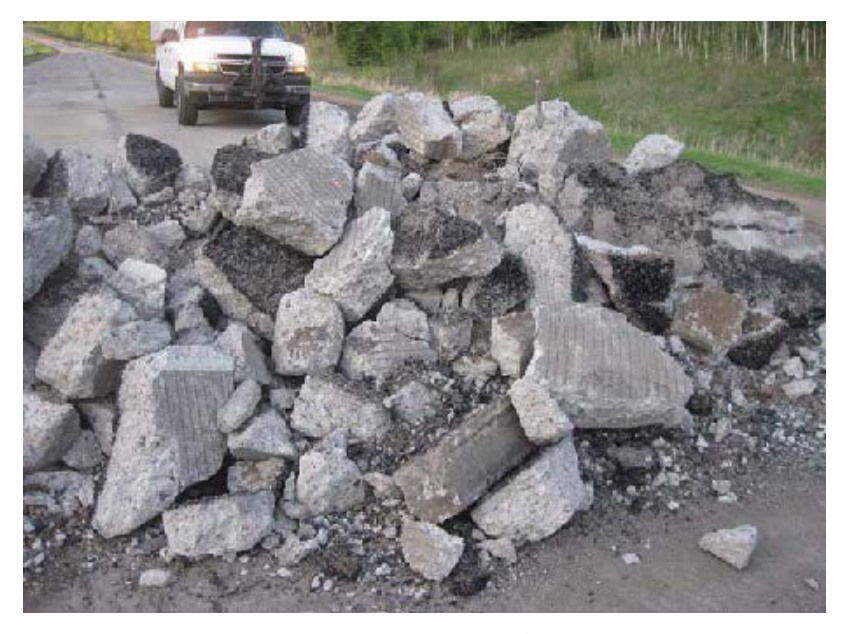
Removing upper layer of concrete