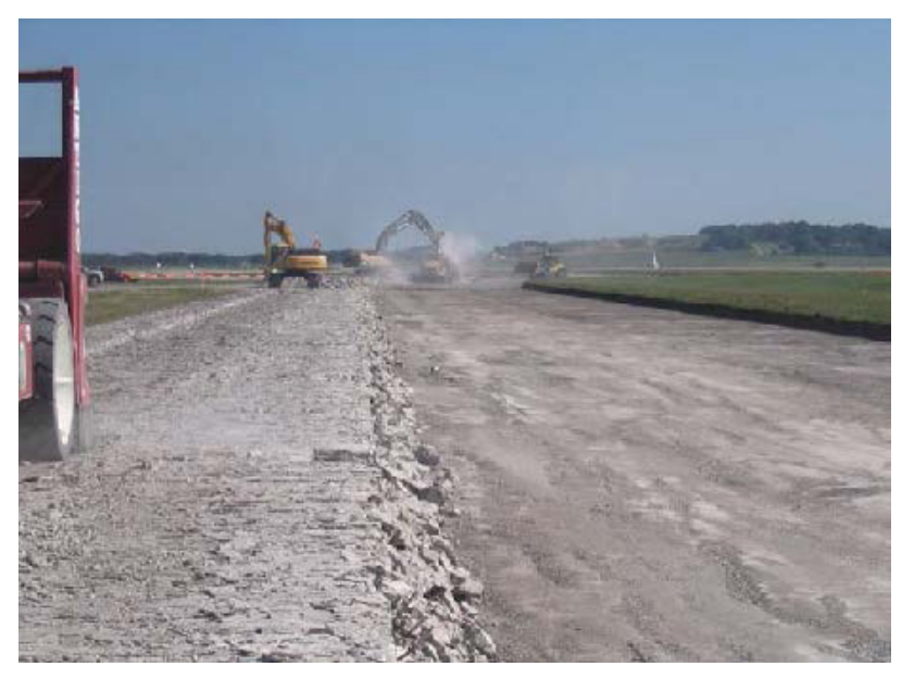
Underlying asphalt layer on right not damaged after breaking and removing upper layer