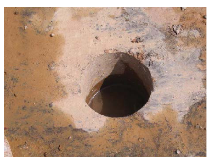
Core through CTB layer