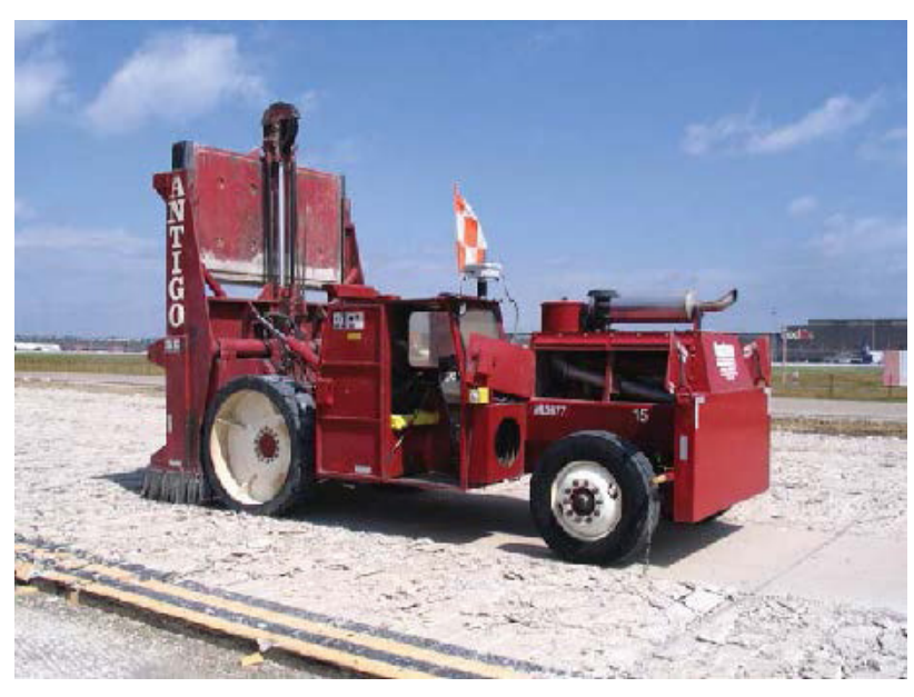
8600 Badger Breaker® breaking concrete