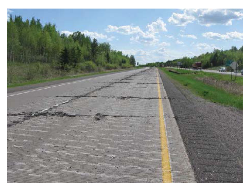
MHB Badger Breaker® breaking pattern