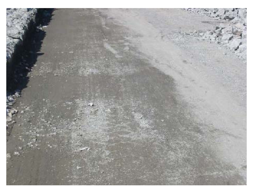
Lower layers not damaged after breaking and removing upper layer