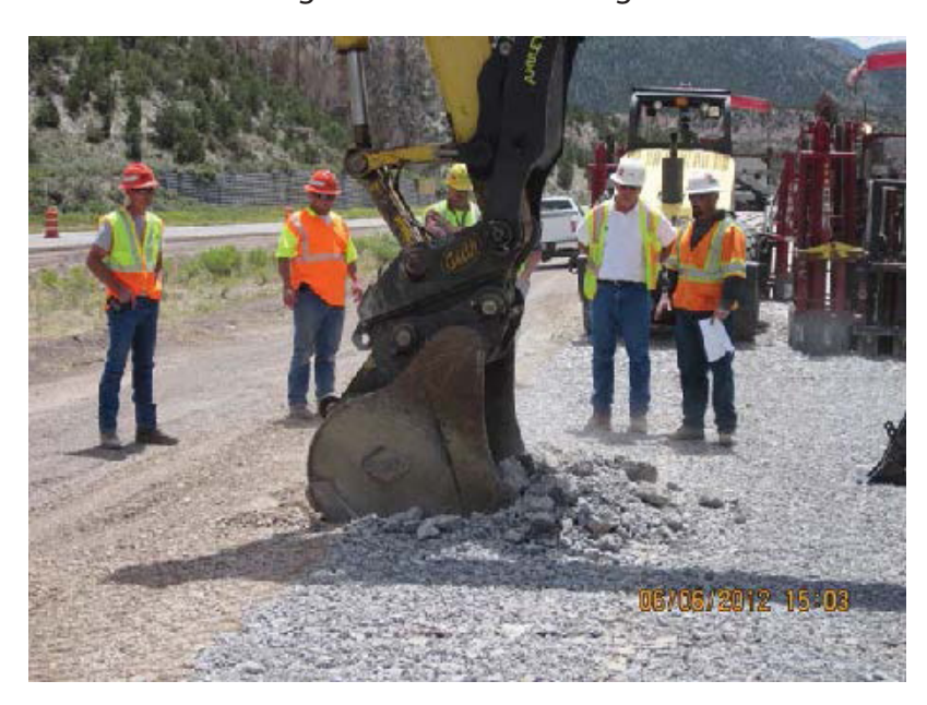
Excavating test hole