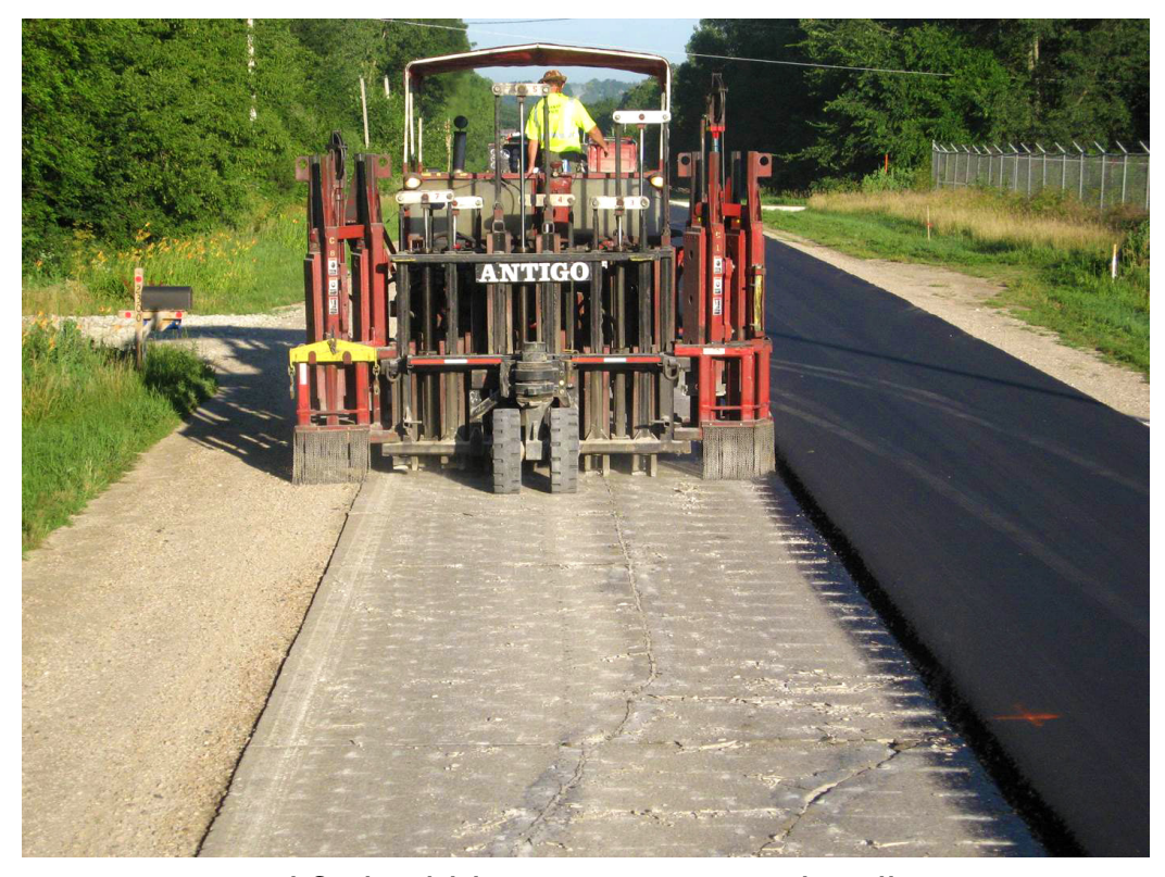
Modified Rubblization – occasional spalling

Achieve 12-inch to 18-inch sized pieces identified with clearly visible cracks at the surface. Occasional surface spalling may occur. The pavement surface will typically look similar to the surface in the following two pictures: