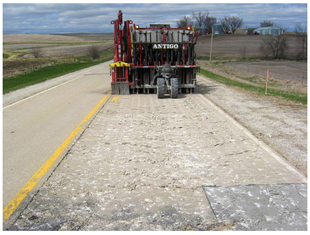
Modified Rubblization - significant spalling

Achieve 12-inch minus size pieces at the surface, significant surface spalling, and a surface appearance that ranges from smooth to pulverized. 75% of the pieces at the bottom of the slab shall be 15-inch minus in size. The pavement surface should look similar to the surface in the following two pictures: