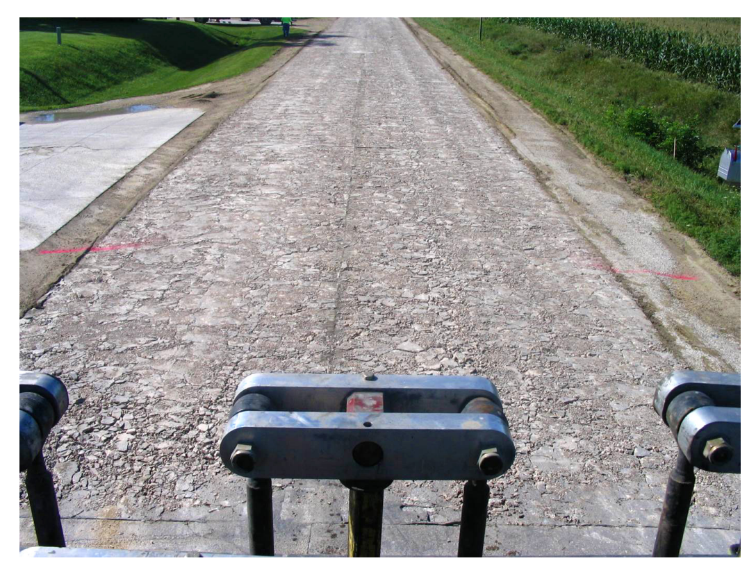
Modified Rubblization – significant spalling