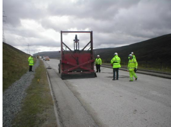
Fig. 3. Use of guillotine to induce fine vertical cracks in existing CBM

The technique first requires the CBM to be exposed by planing off the asphalt. The CBM slab is then broken into smaller lengths using specialist equipment: typically a self propelled five tonne guillotine (Figure 3). The force required by the guillotine to break the CBM with a neat single crack depends upon many factors including the CBM strength and thickness, as well as the underlying support. The drop height needs to be controlled and continually reviewed to ensure that the pavement is not being over-cracked or under-cracked. As a result of the cracking operation, the strains resulting from thermal movements are reduced and distributed more evenly. It is extremely important that the cracks created are fine, transverse and vertical to maintain good load transfer between CBM sections. The technique tackles the root cause of reflection cracking: that is, the thermal movements at individual cracks are much smaller and the occurrence of transverse reflection cracks in a new asphalt overlay are minimised. After the cracking treatment, the CBM surface is rolled with a minimum of six passes of a 20 tonne Pneumatic Tyred Roller (PTR). This seating operation is carried out to assist the full-depth propagation of induced cracks and to minimise the rocking of concrete at the location of any voids that may be present under the CBM prior to overlaying with a minimum of 150mm of asphalt.